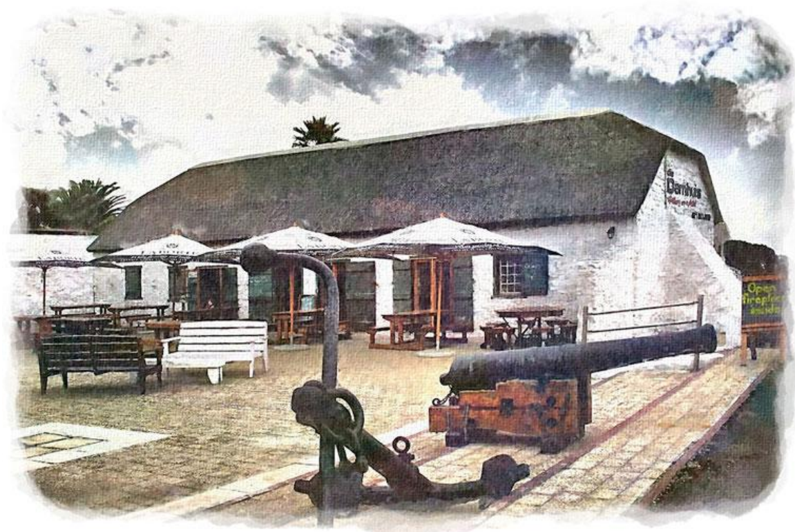
The first Restaurant with cannon