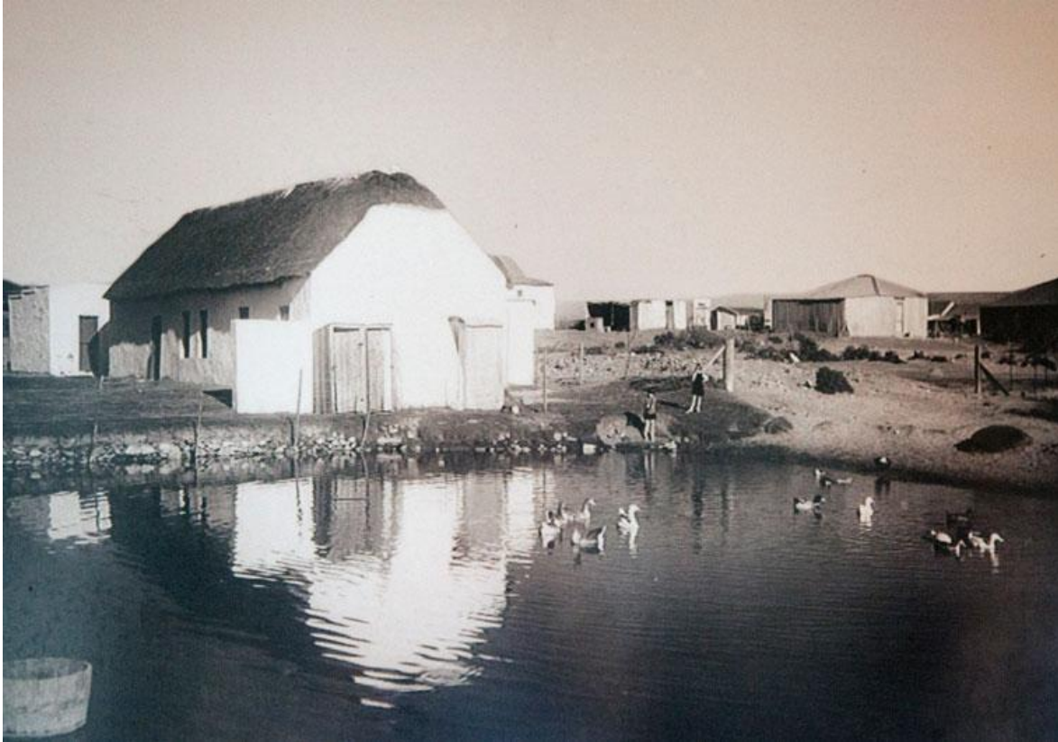
Many moons ago

The water from a fountain, which exists to this day, formed a dam on the side of the shed hence the name “Damhuis”. The present Beach Road is now where the dam was.