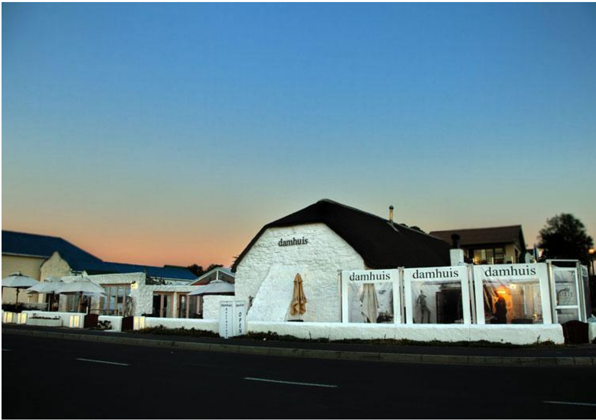
Current Restaurant with 8pdr defending the front.