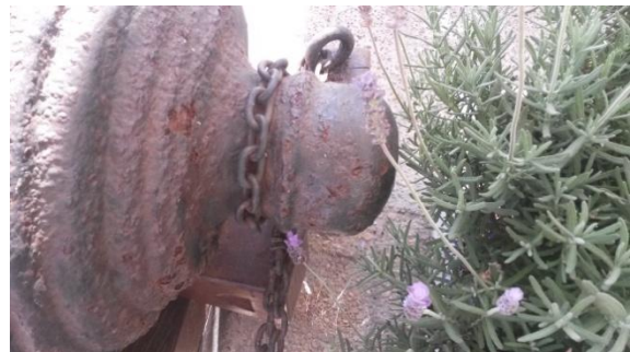
The 8pdr with corrosion blisters in April 2015, before the restoration.